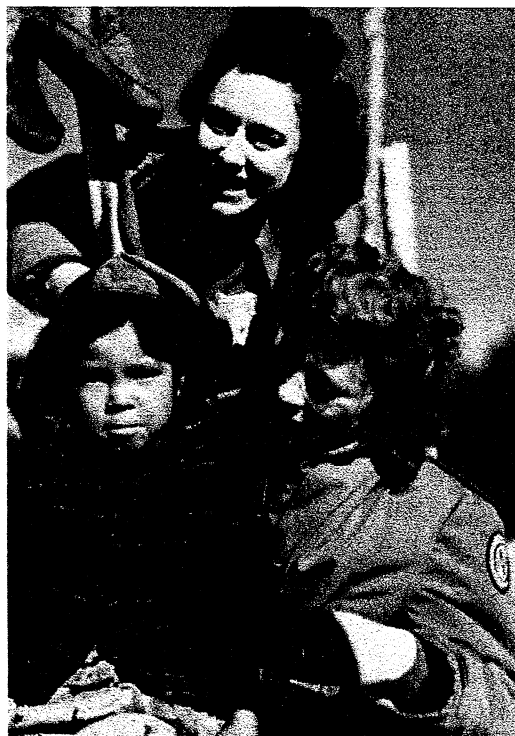
American Red Cross Field Staff, Labrador, 1945