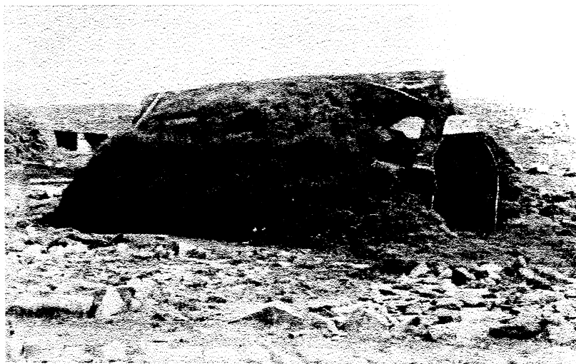
A Fisherman's Hut, Labrador