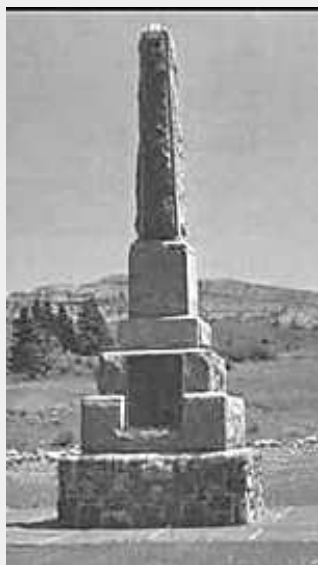
John Guy monument, Cupids

If you have an item of news, an anecdote, a picture from the past, an old saying, an event of historical interest happening in your corner of Newfoundland and Labrador, why not share it with fellow members in your NHS Newsletter? Simply mail your contribution to the postal address on the first page or email it to nhs@nf.aibn.com .