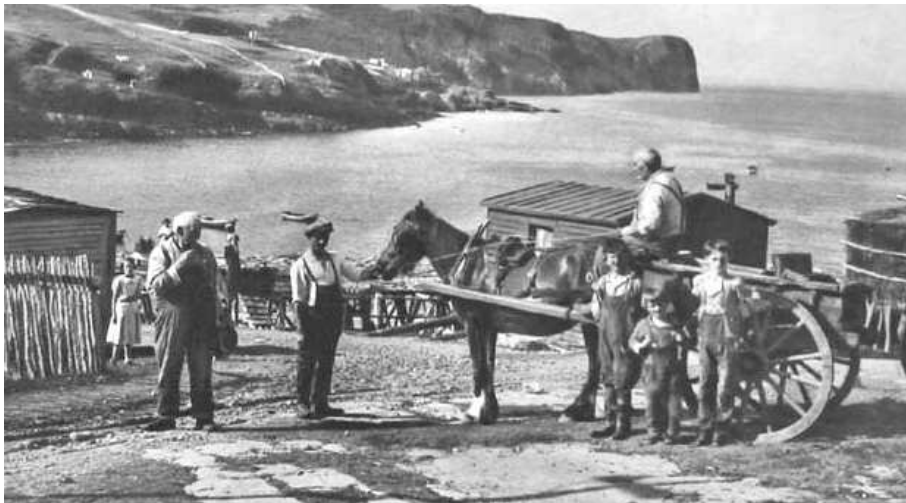
Flatrock, early 20 th century.