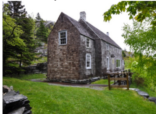
Kent Cottage at Landfall